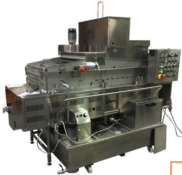
In the figure Model G-2460